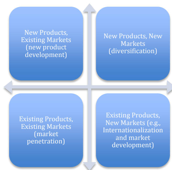
Figure 2: Ansoff’s Product/Market Growth Matrix 17

These four growth vectors may be pursued organically through internal development only, or through external, acquisitive growth. Although there are exceptions, younger and smaller enterprises tend to emphasize organic growth, while more established and larger organizations more frequently emphasize acquisitive growth. 18 Growth may also be accelerated through corporate venture capital investments, alliances and joint ventures, which create access to sources of external knowledge and capabilities. 19